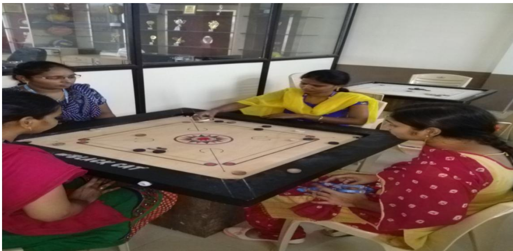
GIRLS PLAYING CARROMS ON THE EVE OF INDEPENDENCE DAY