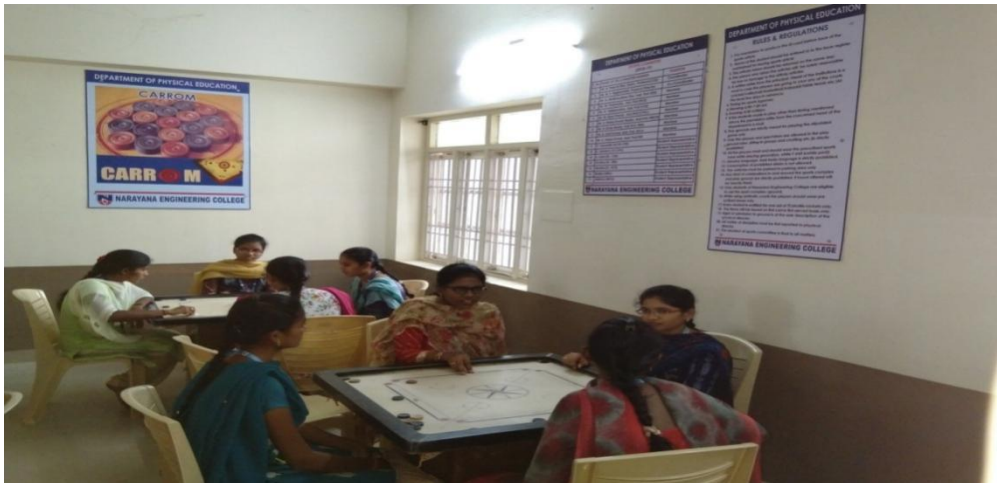
GIRLS PLAYING CARROMS ON THE EVE OF INDEPENDENCE DAY